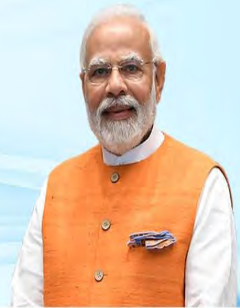
SHRI NARENDRA MODI PRIME MINISTER